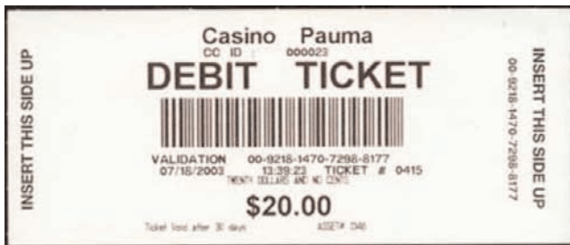
Front: Debit Ticket The result of an ATM transaction.

Quik Play personnel have been at Casino Pauma promoting the system, handing out promotional calendar cards, and answering customer questions.