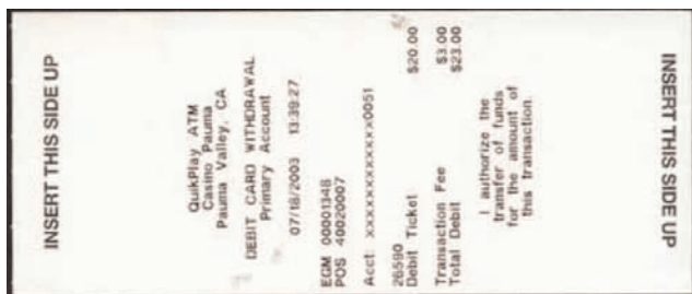
Front: Customer Receipt Optional receipt. Shows $3 fee.