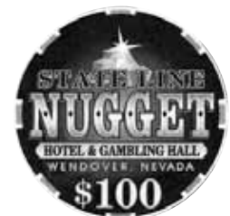
State Line Nugget Casino House Chips

Wendover's closed casinos include Jim's Casino and Saloon which operated from 1979 to 1983. Jim's was torn down to make room for The Silver Smith Casino. The A-1 Casino operated from 1956 to 1967, the Gold Rush Casino operated from 1981 to 1984 and was razed to make room for the Peppermill, the Hideaway Casino operated from 1976 to 1980.