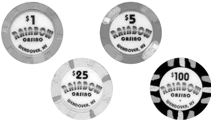
Rainbow Casino House Chips