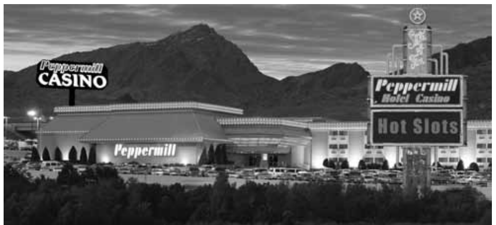
Peppermill Hotel, Casino

as legendary entertainment and gaming establishments. With the largest Poker room and the only Race and Sports book in town.