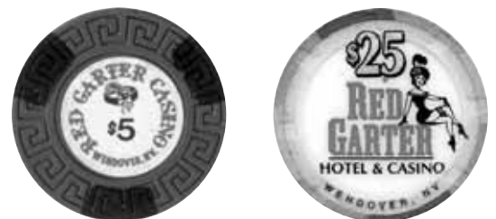
Red Garter Casino House Chips