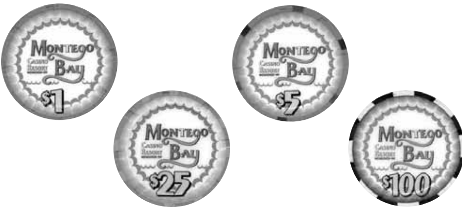
Montego Bay Casino House Chips

and the Smith family's Silver Smith has been purchased by the Peppermill and re-named Montego Bay.