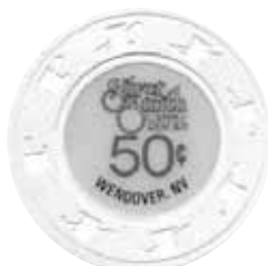
Silver Smith Casino House Chips