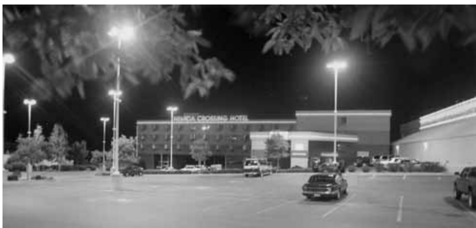
Nevada Crossing Hotel