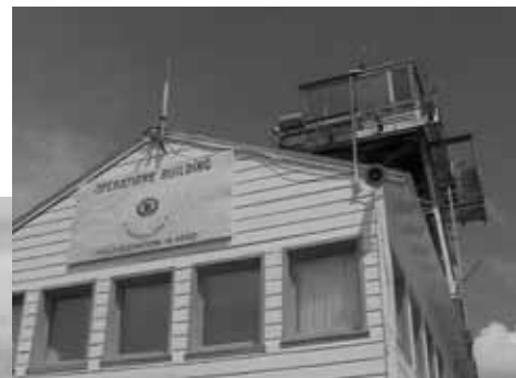
Wendover Field today