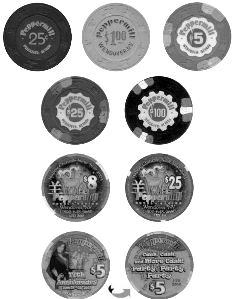
Peppermill Casino Chips