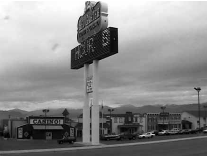
Red Garter Hotel, Casino