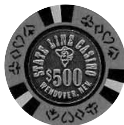
State Line Casino House Chips