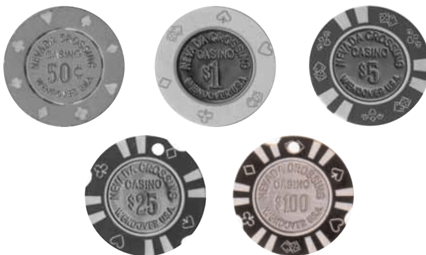
Nevada Crossing Casino Chips